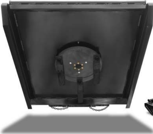
DETAIL UNDER DECK