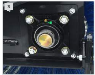
1. SWING LINKAGE SYSTEM SELF-CENTERS BROOM WHEN ANGLED